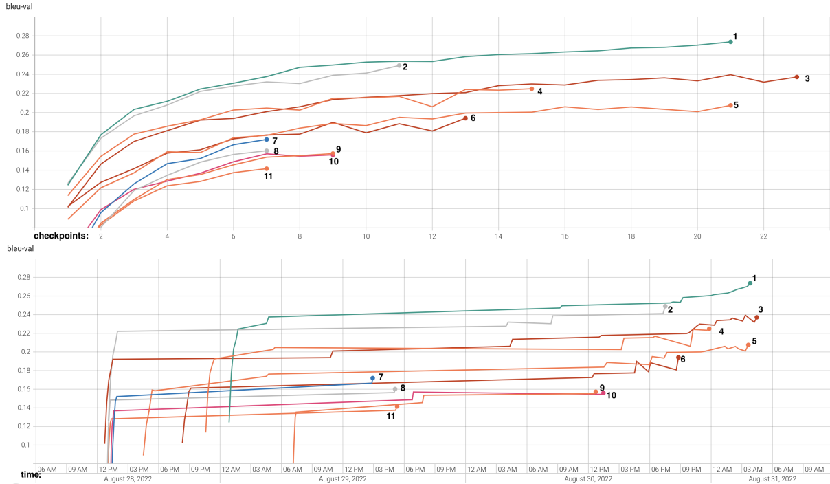
Figure 3: Learning curves for a random sample of configurations in ASHA. The y-axis is the validation BLEU score. The top figure, where the x-axis represents # of checkpoints, is analogous to Figure 2 and shows which configurations are promoted. The bottom figure represents the same configurations plotted against wallclock time on the x-axis; this illustrates the asynchronous nature of ASHA. Observe that configurations are not started in sync, and long plateaus indicate when ASHA decided to pause the configuration at a checkpoint to allocate GPUs for other ones.