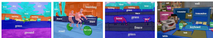
Figure 24 : Classifying local image patches. The images show the groundtruth (Mottaghi et al., 2014). Certain classes – sky, grass, water – can be classified approximately from small image patches.