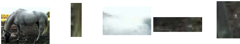
Figure 23 : The local ambiguity of edges. An observer has no difficulty in detecting all of the boundary of the horse if the full image is available (left). But it is much more difficult to detect edges locally (other panels).