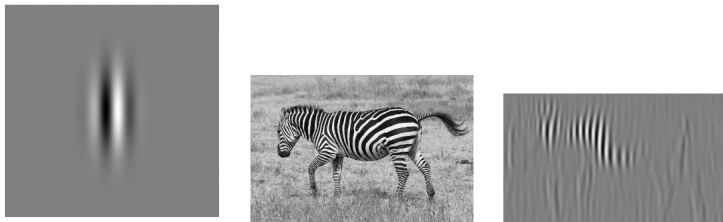
Figure 16: A Gabor functions aligned to the vertical axis (left). The image of a zebra (center). The response of the vertical Gabor filter on the zebra image (right).